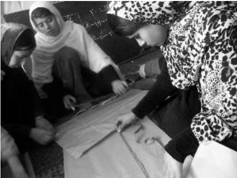
KABUL, Afghanistan -- Women and girls in one of RAWA's "income generation" projects, learn how to sew and embroider clothes.