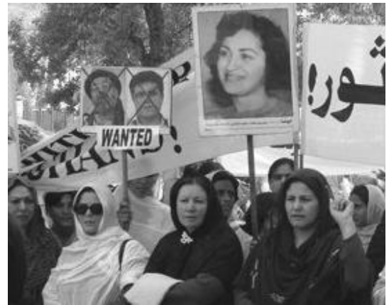
ISLAMABAD, Pakistan – Carrying images of Meena, Afghan women march at a RAWA demonstration against fundamentalism and war in their nation.

In 1977, a young Kabul University student named Meena, founded the Revolutionary Association of the Women of Afghanistan (RAWA) to struggle for women's freedom in a conservative country. After the 1979 Soviet invasion, RAWA expanded their mandate to fight against fundamentalist misogyny and foreign domination. For three decades they have empowered Afghan women through humanitarian aid and political agitation. After Meena's brutal assassination in 1987, RAWA continued their work underground and today are on the forefront of the women's rights movements. Their projects include schools and orphanages for boys and girls, literacy courses for adult women, health clinics, the publication of their political magazine, Payam-e-Zan, documentation of human rights abuses, and public demonstrations. RAWA is a non-sectarian, non-violent organization advocating secular democracy, women's rights, and human rights in Afghanistan. For more information, visit www.rawa.org .